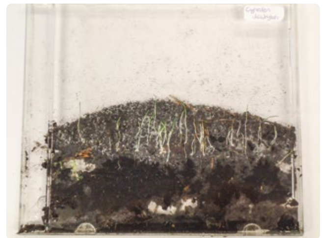
FIG. 1 Cynodon dactylon

Fill half of a CD case with compost and plant the seeds 1 cm under the surface. Stand the CD case on its side in a tray filled with 2 cm of water (so that the soil stays damp). It should look like the picture shown in the figure below ( FIG. 1 ). Let it grow for a period of time ( FIG. 2 ) on a sunny windowsill and check regularly to ensure it has plenty of water. Do this for ryegrass, Bermuda grass, Poa annua and other species found growing outside of your school or home. Each species should have its own CD case and stand on the same windowsill.