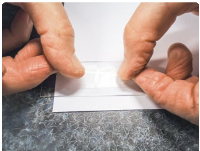
FIG. 4–7 Technique to find out the number of stomata